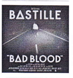
MOST DOWNLOADED TUNES